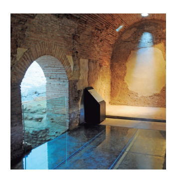
↑ Hot room.

of the fire from the adjoining furnace, the smoke produced by the burning of fuel being evacuated by means of four chimneys 5a whose openings were in the corners under the floor. The room had two alcoves at the ends 5b similar to the ones in the cold room. The bathers scooped up the almost boiling water from the boiler and poured it over their body, producing large amounts of steam. They then splashed themselves with cold water on an alternating basis, which was the whole point of the bath. They would be assisted by a servant or bathsman (kiyassa for men and tayabaste for women) who would lather and scrub them vigorously.