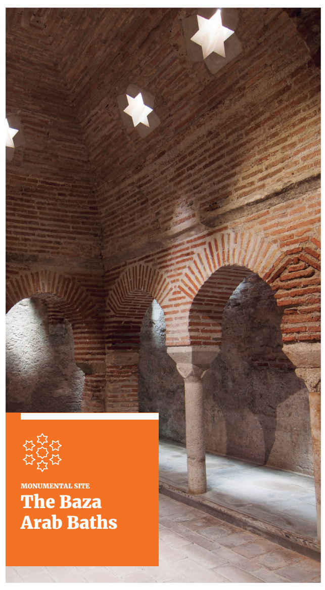
↑ Warm room (al-bayt al-wastani) of the Baza Arab Baths.