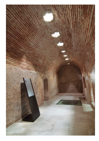
↑ Cold room.