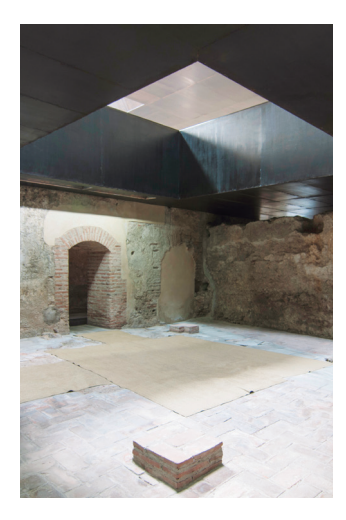
↑ Entrance hall (vestibule) to the Baths.

Here bathers undressed and were given towels, soap, sponge, wooden stilts so as not to burn their feet and a couple of wooden buckets. On the current floor you can see remains of the original brick and stone flooring (jabaluna), as well as of the darro 2a or atarjea that drained the dirty water from the inside of the baths to the gully that ran alongside the building (now Calle del Agua). Also <u>pr</u>eserved are the brick jambs 2b of the original door that gave onto the street, from the time the baths were in use, between the 13th and 16th centuries.