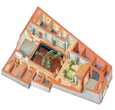
↑ Idealised reconstruction of one of the Munigua houses.

To date there are seven houses excavated in Munigua. They were different sizes house 1 has a surface area of 500 square metres and came to have 22 rooms - its floors were adapted to the existing urban planning and underwent different renovations throughout its existence. All of them would have an upper floor, such as house 2 - next to the Forum used the ground floor to carry out business operations. There are houses have, still, walls remaining that are 2 metres high. In one of the rooms in house 5, a treasure of 122 coins was discovered, almost all of them from the second half of the 4th century.