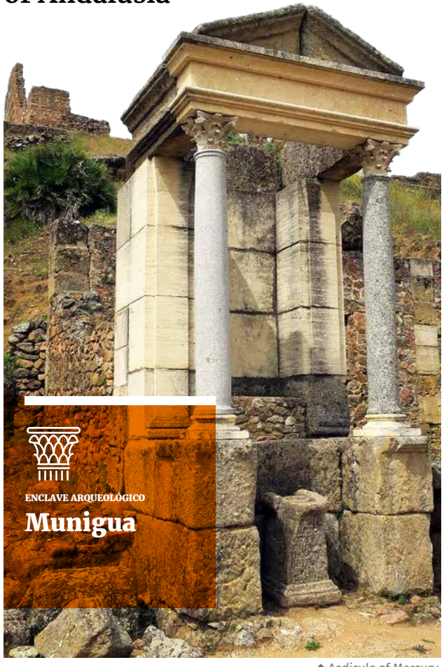
↑ Aedicula of Mercury

Archeological and Monumental Settlements of Andalusia