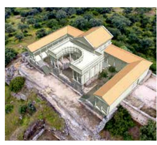
↑ Idealised reconstruction of the terrace Sanctuary.

It is raised at the highest point of a hill and for its construction, dated in the final third of the 1st century A.D., it was necessary to construct large retaining walls, especially on the western side. The building, which faces east, is symmetrically organised according to axial axis. It is accessed through sloped streets (one to the north and the other to the south) which are entered through identical doors. In the central terrace the semicircle exedra opens that frames the landscape it faces. Above it, on the last terrace is the cella. a small building in which the divinity would be housed. The inscriptions located in the area allude to the goddess Fortuna and to Hercules. The sanctuary would be connected to them. The Iberian settlement, of which some of its foundations can still be seen, was demolished for its construction. The sanctuary's walls were originally covered with various shades of marble. This building was the subject of extensive conservation and restoration interventions in the 1980s.