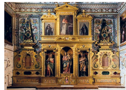
↑ Altarpiece of the Chamber of the Reservation.

It owes its name to the fact that in it the Most Holy was reserved on Maundy Thursday. Starting in 1636 it received a decoration with Marian motifs. In the altarpiece we find the Virgin and Child , Saint Joachim and Saint Anne , works by Martínez Montañés, and in the vault litanies symbols, the Holy Spirit and cherubs. We can also admire the series of paintings of the Life of the Virgin Mary .