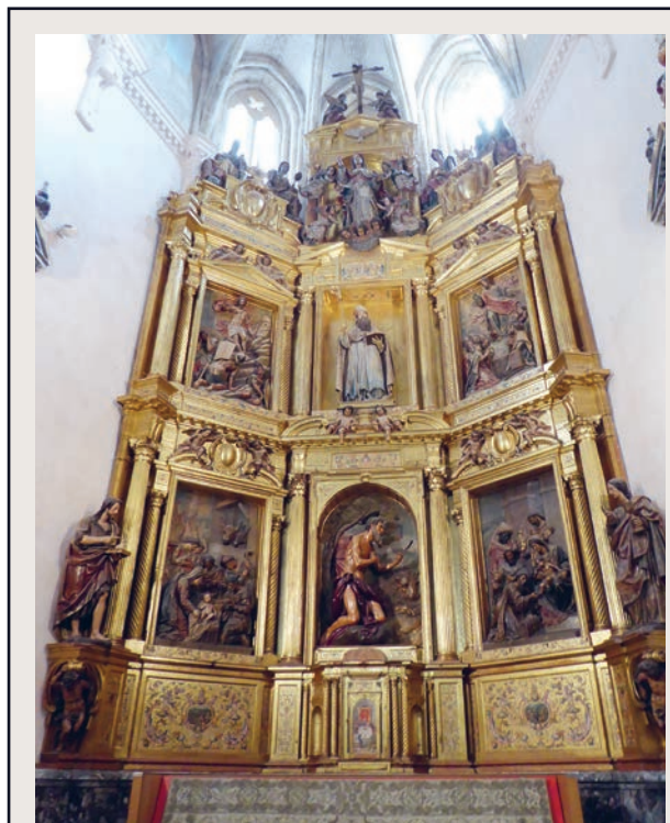
↑ Altarpiece by Martínez Montañés in the first church.