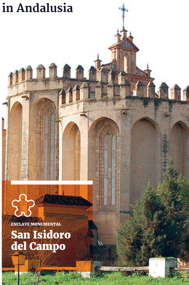
↑ View of the Monastery from the apses of the twin churches.