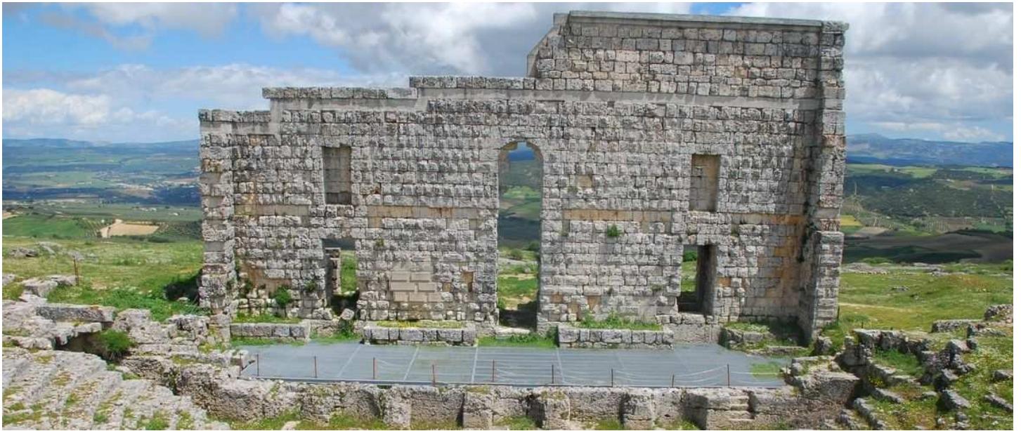
Acinipo's Roman Theatre