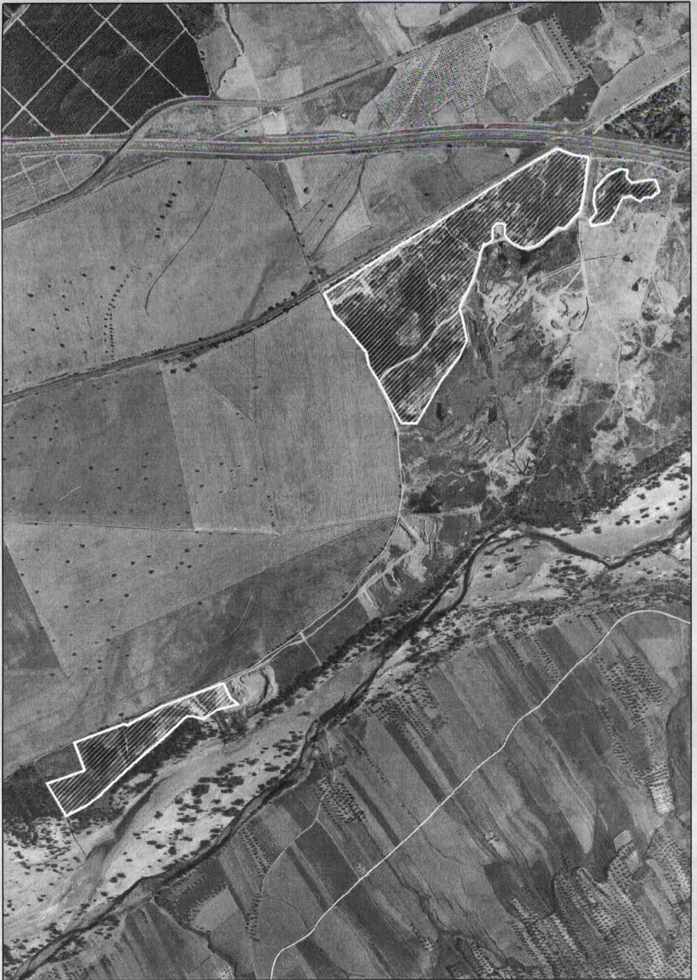
Humedal Andaluz: Gravera de Balastrea