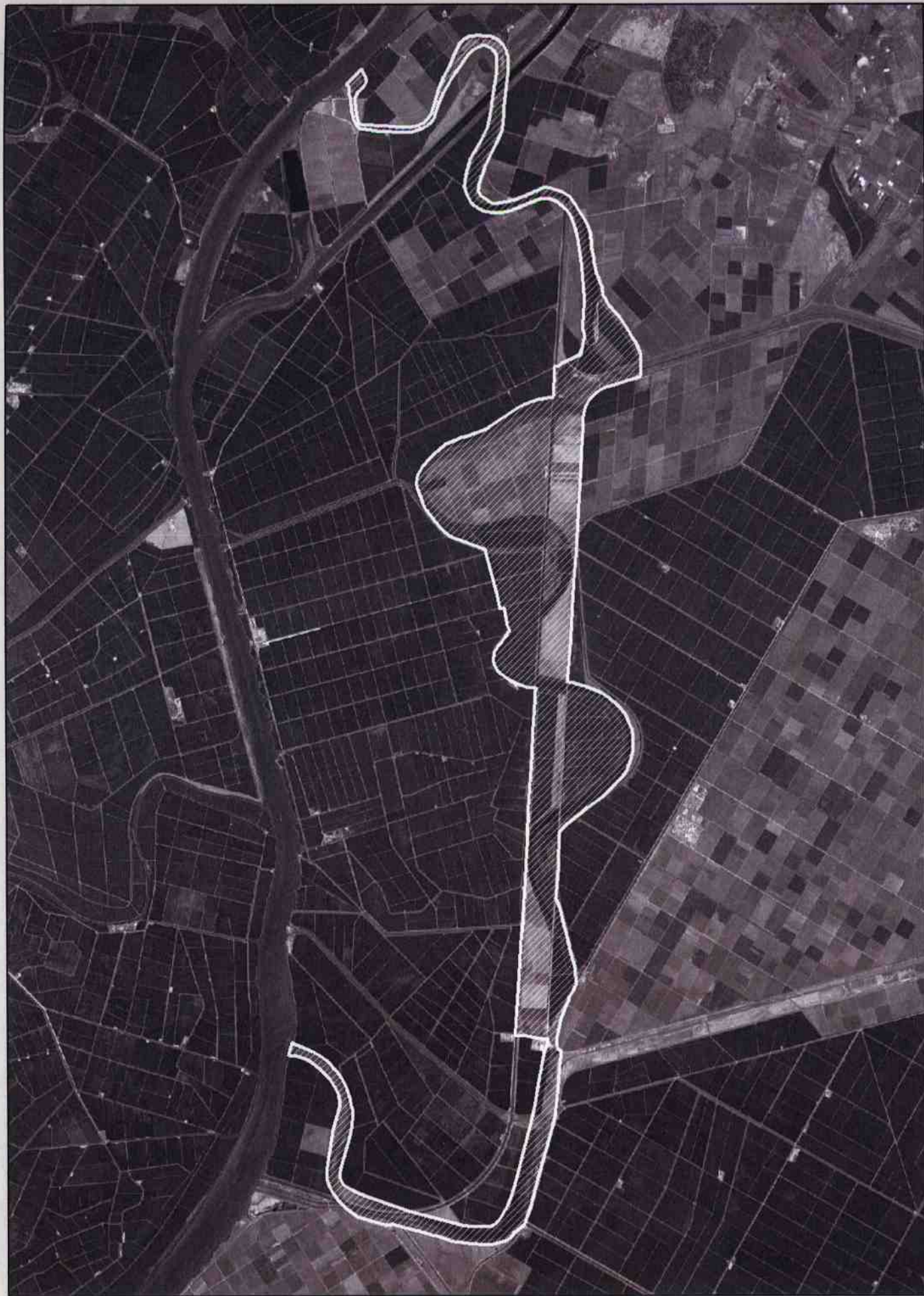
Humedal Andaluz: Brazo del Este