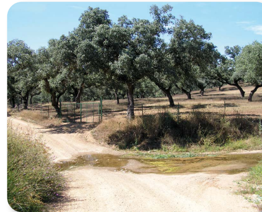
The meadow is a forest cleared for multiple uses (livestock, agriculture, forestry...), in which many of the natural values of the original Mediterranean forest are preserved.

We advance between stone walls that separate us from orchards and other crops, revealing the antiquity of the path and recalls ways of life of the past. We also see lines of prickly pears, which are another type of traditional fencing. Just after the crops, we enter the domains of the meadows, the most characteristic formation of the natural park.