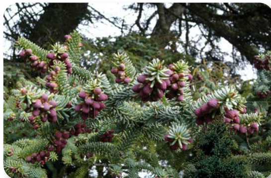
The Spanish fir, the emblem of the Sierra de Grazalema Nature Park, belongs to a new species of fir present in the mountains around the Mediterranean. This particular species is only present on these mountains, the Sierra de la Nieves and the Sierra Bermeja.

We continue left along a stony path [4]. It is said that in medieval times this was used by the old inhabitants of the area to travel between Benamahoma and Grazalema. We continue our descent under the shade of enormous gall oaks and the occasional Spanish fir.