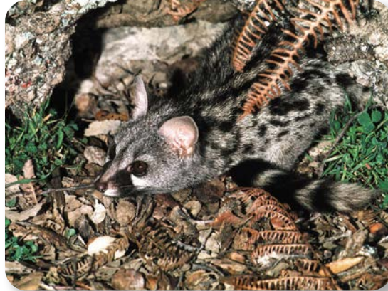
Due to the thick vegetation, these mountains are home to deer, mongoose and genets.

After closing the gate behind us, there is a short gentle rise with an irregular surface and the odd step.