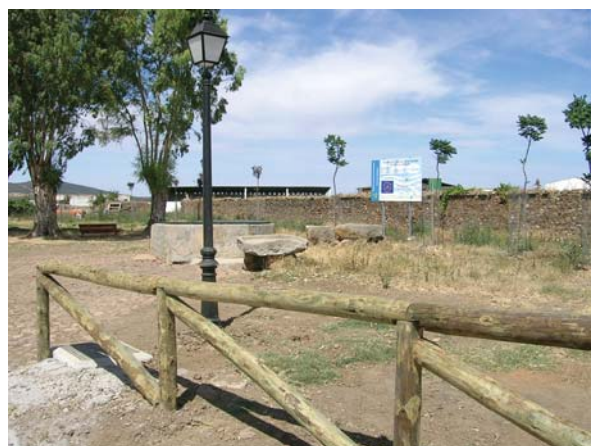
Well of Las Mulas

As for the appreciation of the aquatic environment we have worked on the recovery of wells and fountains, as well as on the fitting-out of leisure areas. Ten infrastructures have been recovered in five small towns of the region, some of which had fallen into disuse or had disappeared.