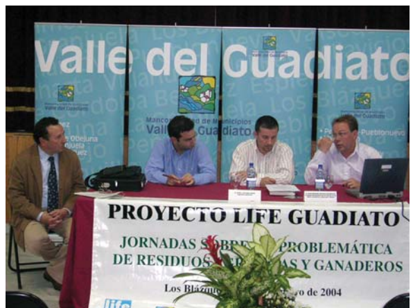
Days of agricultural residues

In order to make ranchers and farmers aware of the need for respectful agricultural and ranching activities towards the environment, several seminars, conferences and formative courses took place in the region. The good farming practices, plant covers, agroenvironmental help, ecological agriculture and cattle raising, as well as the reuse of ranching waste were some of the topics dealt with. More than 250 people benefitted from these formative and spreading actions. As a didactic support to these initiatives several information booklets about ecological agriculture and handbooks on good farming practices were published.