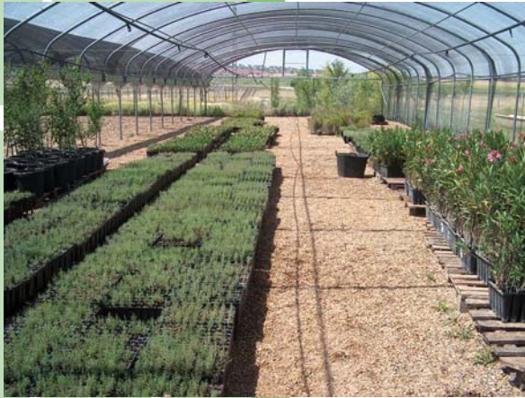
Fish-pond La Granjuela

In order to search for new options in the treatment of organic waste and optimization of plantations and growing in nurseries, an experience on compost of manure by means of earthworms was started up in the technique called vermiculture. The resulting compost has been successfully applied in different trials in the nurseries which are managed by the Life Guadiato Project. On the other hand, this experience expects to be the first step in the treatment of waste in the region of the river Guadiato.