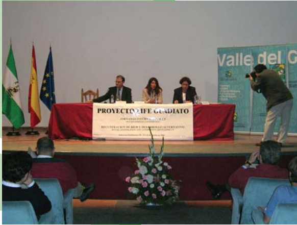
Inauguration of the International days

Some international conferences called "Recovery of rivers and alternative development" took place as a completion of the Project. Here we let people know the final results of the Project; we shared our experience with professionals and people who were interested in the topics the Project dealt with.