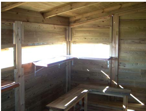
Observatory of birds

Thus, three bird observatories have been set up in the reservoirs of the region. These bird observatories have panels which show the richness and variety that can be found in the region. We published 10,000 copies of spreading and information booklets about these observatories and 4,000 copies of the guidebook of birds in the region, where we can find every marsh bird which lives in them.