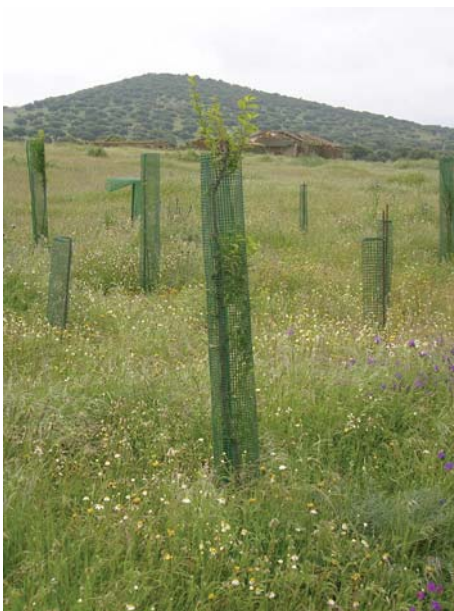
Plantation descansadero silleró

That is why, the Community of Municipalities of Valle del Guadiato has managed the life Guadiato project for the last three years. This Project has incorporated the environmental perspective in the development strategy in the region of Guadiato. So that one of the main goals of the Project was to boost alternative economic activities to the current ones which generate jobs in activities related to environmental protection as well as a change in the way people 'see' the river. In order to achieve this, a flexible methodology was applied, based on a system where the population participation was constant, a system of information and spreading of the results which have been being achieved.