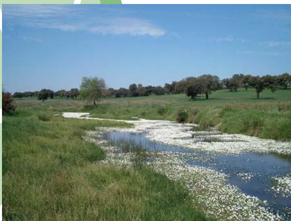
Ranunculos river Guadiato

As a pioneering activity in the region, we made periodic water analyses all along the course of the river, which characterized it from the physical, chemical and biochemical points of view. They gave us an exhaustive information about the environment they have proved to be an indispensable starting point for the actions aimed to improve the ecosystem of the river Guadiato. The analyses were based on the quality gauges for the classification of the ecological state of rivers described in the Appendix V of the Directiva Marco del Agua (2000/60/CEE).