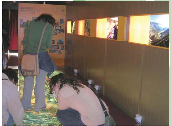
Visitors in the Center of interpretation

Its innovative appearance stands out because of the three goods vans which recall a goods train. Inside we can pay a didactic interactive visit so we can get to know the region of the river Guadiato, its villages and small towns, customs and traditions, gastronomy, natural resources, the flora and fauna, paying a special attention to the river Guadiato.