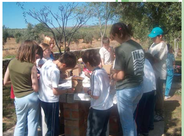
Encampes La Granjuela

Children and young people were the most important addressees when diffusion and spreading activities as well as environmental education were to be established, making them be aware of the need for us to preserve and improve our natural environment, as well as promoting participation of the people. Conferences, contests, campaigns, traveling exhibitions brought to schools and highschools in the region, working camps of both community and national nature, workshops, plantations and environmental camps were some of the activities carried out.