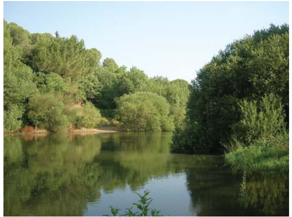
Bank of the river Guadiato

These specific results which have been achieved stand out from the rest: