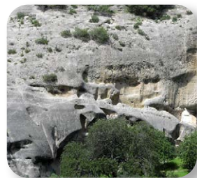
The walls of this mountain consist of sandstones that allow the formation of caves, once used as dwellings

Another characteristic feature of this area is the composition of its mountains, made up of sandstone rocks, which are much more sensitive to erosion caused on this occasion by the effect of strong gusts of wind. On the opposite shore, we can find a spectacular arch in a sandstone wall known as La Roseta.