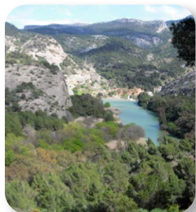
Gaitanejo Reservoir, along the right bank of which runs part of this path, surrounded by abundant natural vegetation and the result of repopulation

We go through a tunnel excavated in the sandstone and pass through an area full of large rocky hollows, until we reach the oldest hydroelectric power station in Spain, the Gaitanejo Dam. (Check [1] on the map).