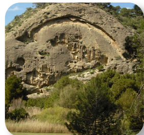
Arch drawn on a huge sandstone wall, caused by the erosive effect of the strong gusts of wind on the huge sandy rocks

Another characteristic feature of this area is the composition of its mountains, made up of sandstone rocks, which are much more sensitive to erosion caused on this occasion by the effect of strong gusts of wind. On the opposite shore, we can find a spectacular arch in a sandstone wall known as La Roseta.