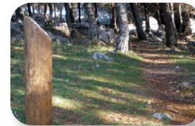
The landmarks are a great help in following the trail in mountain areas.

We rise through a craggy area until we reach the crown of a small saddle [2]. Behind us there are magnificent views with the Peñon Grande dominating. We enter another compact pine grove whose shade will be appreciated in the warm season. Within the pine grove we pass a number of crossings. They are well signposted so there's no confusion and all we have to do is follow the landmarks that mark the route. Among the pines, taking advantage of their protection during growth, the odd holm oak appears.