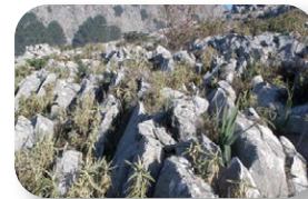
Limestone pavements are very common in these mountains.

We rise through a craggy area until we reach the crown of a small saddle [2]. Behind us there are magnificent views with the Peñon Grande dominating. We enter another compact pine grove whose shade will be appreciated in the warm season. Within the pine grove we pass a number of crossings. They are well signposted so there's no confusion and all we have to do is follow the landmarks that mark the route. Among the pines, taking advantage of their protection during growth, the odd holm oak appears.