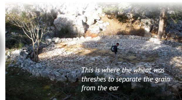
This is where the wheat was threshes to separate the grain from the ear

Nearby there are several trails that offer the opportunity to enjoy the mountains, the Los Charcones trail that rises to Puerto del Boyar alongside a cedar forest and the Puerto de las Presillas trail which takes a more mountainous route.