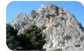
The Peñon Grande is one of the park's free climbing zones.

From the pass we descend along a well marked path to the Llano del Endrinal [4], a beautiful spot is a truly spectacular setting. After descending the pain, we return the trail towards Puerto del Endrinal and we continue to the canyon alongside