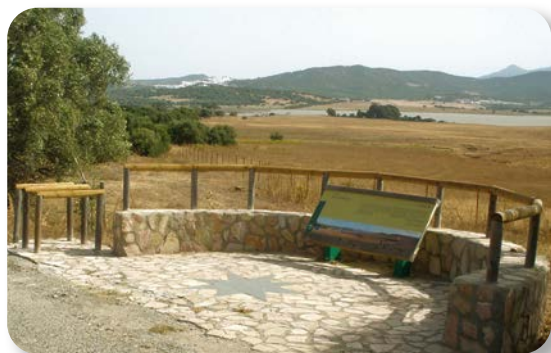
Excellent viewpoint with magnificent panoramic views