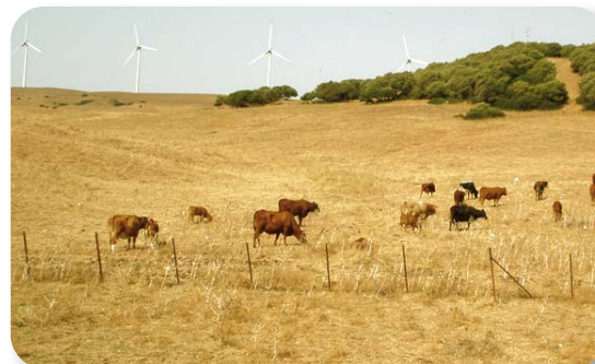
Tradition and modernity share natural space

about 1.2 km from the end point of the path. We recommend that you ask about this at the El Aljibe Visitor's Centre.