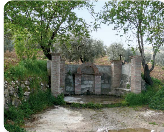
Fountain at the beginning of the trail. Water is the main character at various points along the route

In just 100 metres, a fountain on the left of the track will allow us to refill our water bottles. We soon reach a crossroads where we turn left to begin a climb.