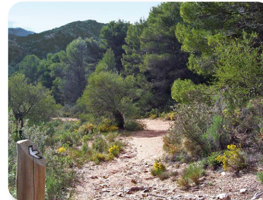
Old feral olive trees are interspersed along the path between reforested pine forests, bearing witness to an ancient landscape in which these slopes were used for cultivation

From here, and until our final destination, the path winds downhill into an enclosed Aleppo pine forest. This pine forest is the result of the natural regeneration of the forest after the abandonment, some time ago, of agricultural work. In fact, we will be struck by the leafy, centuries-old olive trees twisting their branches among the pines. Despite the lushness of the pine forest, in some sections we can look over the canopy and stop to admire the impressive Sierra Prieta massif to the northeast.