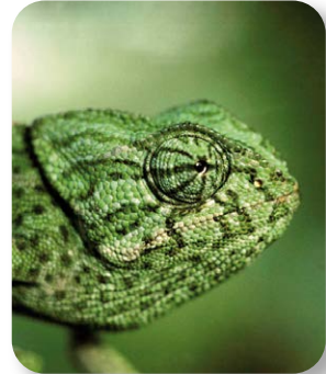
Animals flee in our presence, but if we keep silent, we are likely to find some of them. The chameleon, a slow-moving, protected species, will try to camouflage itself in order to go unnoticed.

Continuing on our way we will cross a gully with water only seasonally [2] and tributaries of the Humaina stream.