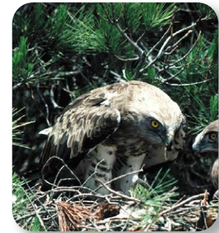
With caution we may come across a wild boar or a squirrel in search of food. Birds of prey cannot be absent from this description either; the short-toed eagle watches us from the sky.

Once we have passed the adapted viewpoint, we continue up the ridge of the firebreak, so that we have views of the two slopes. We will continue until we join the lane again to take another lane to the left at the bend.